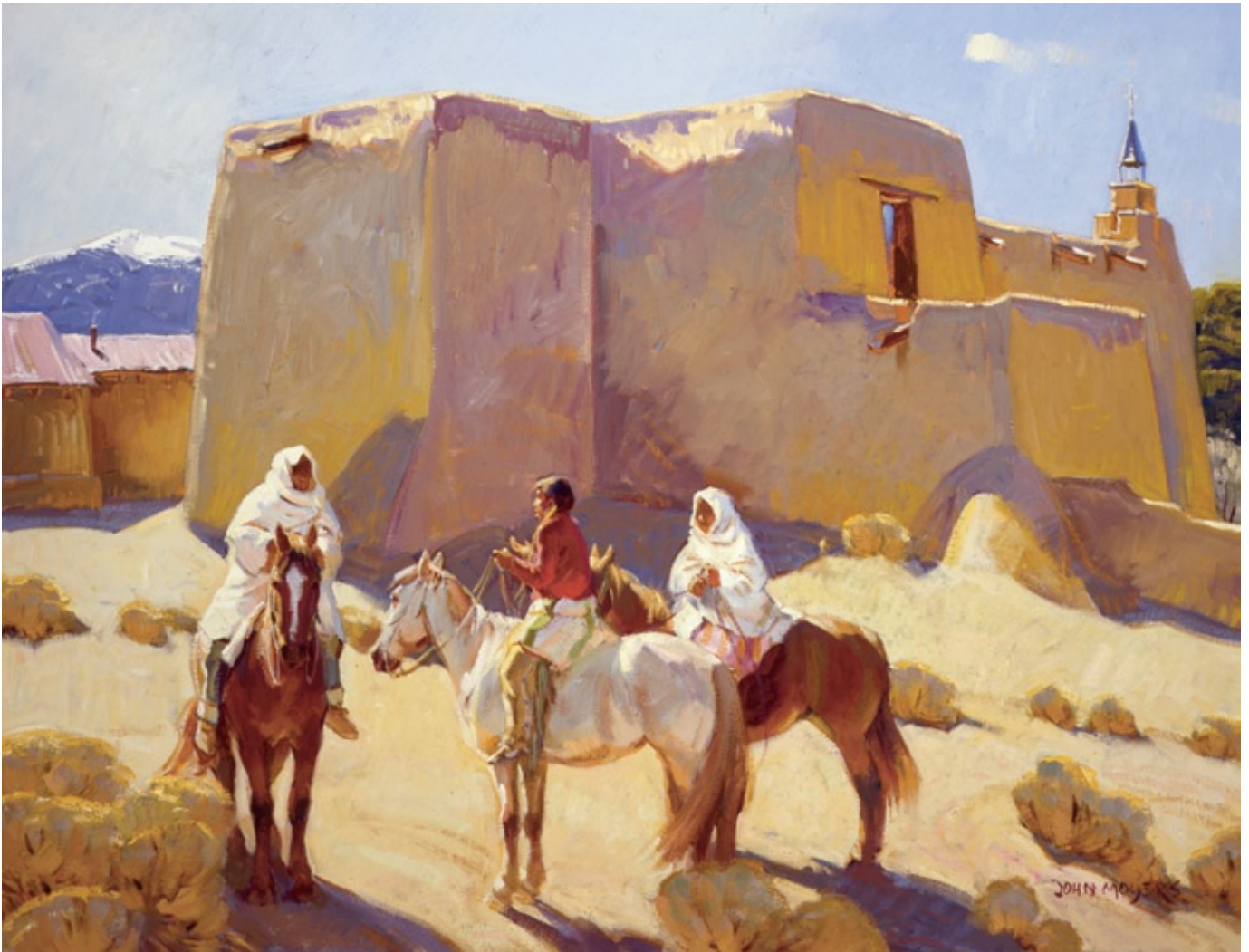
John Moyers, Difference of Opinion , oil, 30 x 40"