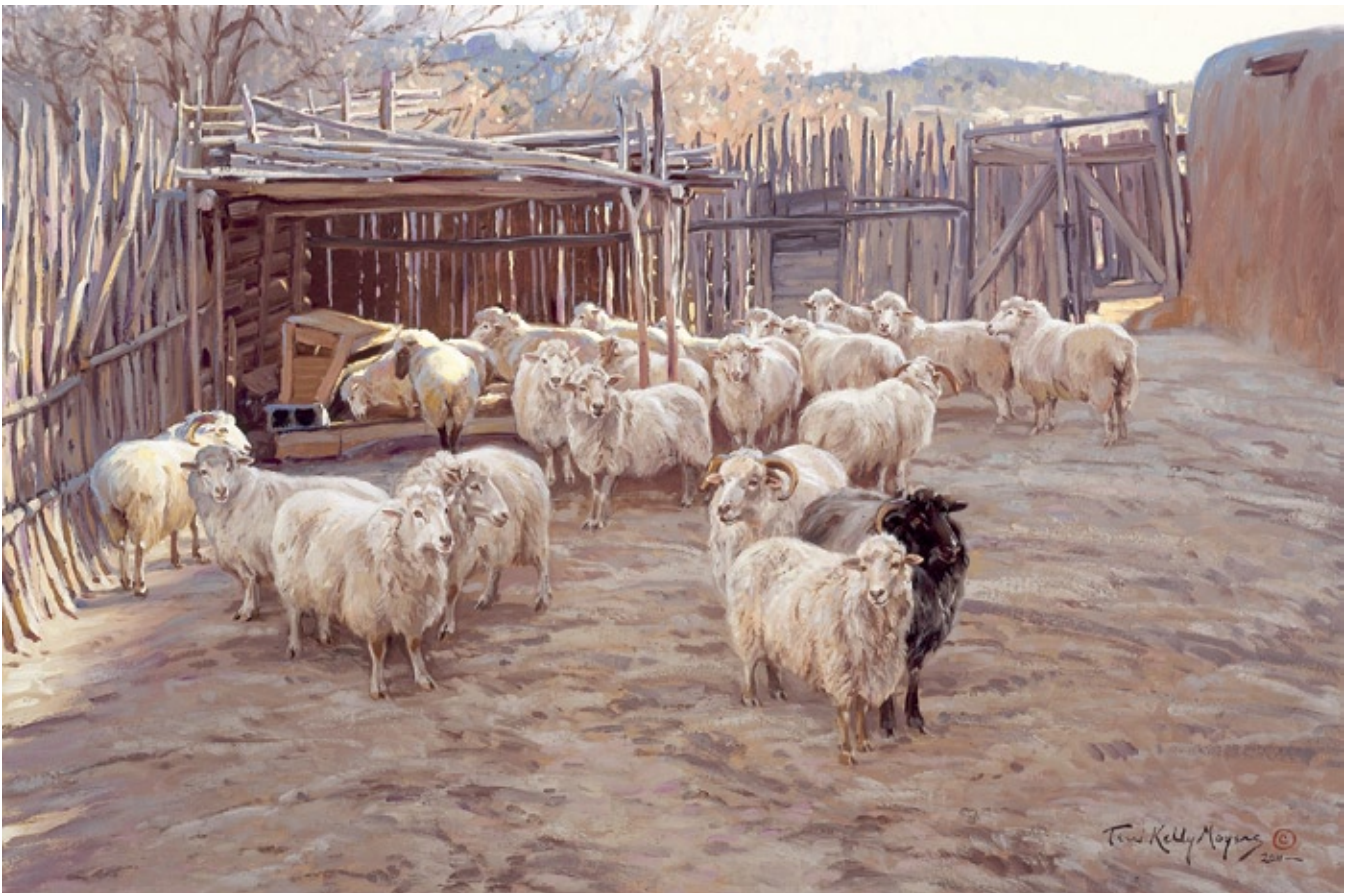
Terri Moyers, The Black Sheep , oil, 24 x 36"